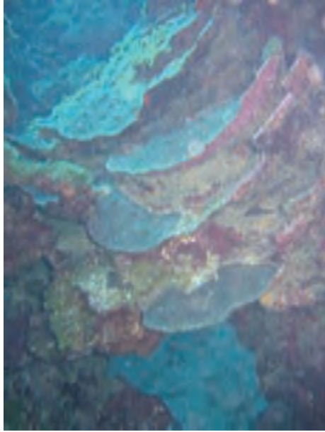
Plate Coral - 1st Swim Through Entrance

Max Depth 50ft/15m Bottom Time 45 Minutes