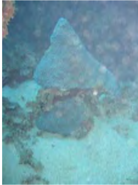
Great Star Coral - 1st Swim Through